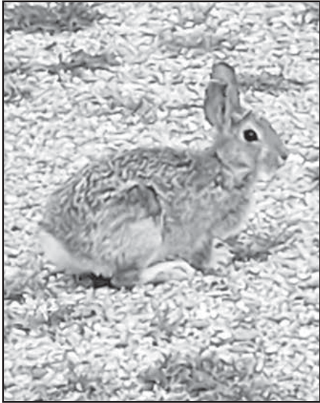
► Picture of ground squirrel and rabbit taken at Douglas Provincial Park June 2023.