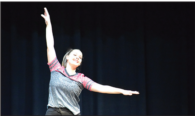
►Talent was on full display as the Watrous School of Dance held its year end recital at Winston High School on Apr. 14. Dancers shared their hard work as friends and family were able to take in the recital.