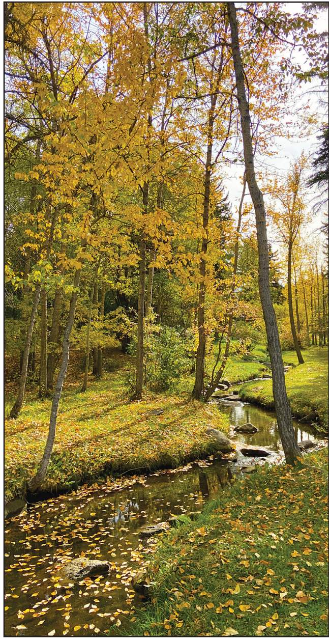
Fall has officially arrived and it started with a beautiful first day Sept. 22.