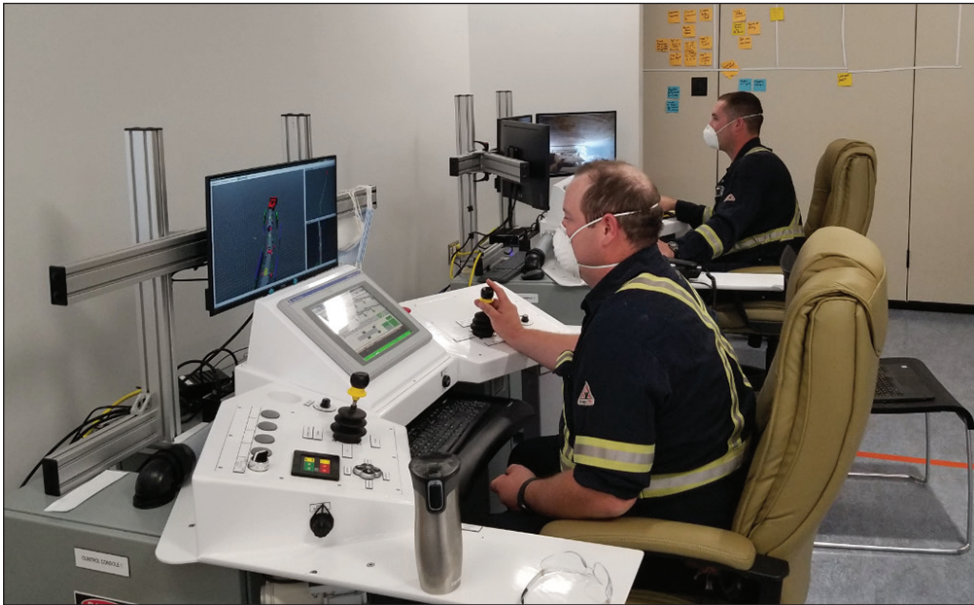
Pictured: Nutrien Lanigan's control centre.

public through much of the pandemic and we were able to keep producing potash. At Lanigan in 2020 and 2021 we had production records through the pandemic but people were really happy to get somewhat back to normalcy in 2022. While there are still a few restrictions and safety continuing to be a core value, we are learning what this new normal is. We are still looking at data and tracking transmission and numbers and if things need to change they can." Getting through two years of the pandemic, looking back, Jackson feels there was some pride created from the mine employees because of the perseverance it took. "It wasn't easy for people but they did it and were able to make it work. It is also great to see the provincial mine rescue competition again this year which is also a big milestone, something that could not be held the past two