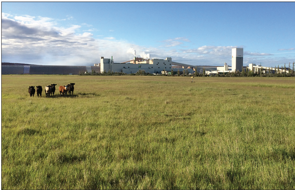
Pictured: Nutrien Lanigan’s site.

Excited about the opportunity to help meet demand, Jackson said the local mine will fire up its second mill later this year. The move also accelerates the company’s five-year controlled ramp up plan. “We are hiring people to run that mill and then we are hiring underground to operate a few more mining machines to provide the ore to the mill. We anticipate hiring into October when we will have that second mill started up.”