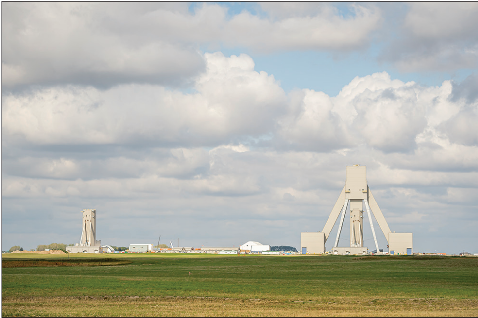
Pictured: BHP Jansen Project.

One of the benefits of Jansen is that the project can be scaled up over time in phases. Jansen Stage 1 contemplates the construction of a potash mine with a production rate of 4.35 million tonnes per year, based on an initial investment of $7.5 billion (Canadian