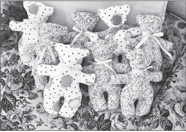
Picture of the hand crafted teddy bears that are given with each baby blanket.

Blankets for Canada will not be meeting Monday, Feb. 20, but will resume the following Monday, Feb. 27. Everyone is welcome to have a cup of tea with us and see how we put together these blankets. We really appreciate all who contribute their time, yarn and squares. The shelters are also appreciative for each and every blanket that they receive from us. Because of your generosity we will be able to continue to supply our blankets. Twenty-six blankets were delivered to two shelters last week. There were 14 adult ones and 12 baby blankets. The baby blankets are each given with a small, hand crafted teddy